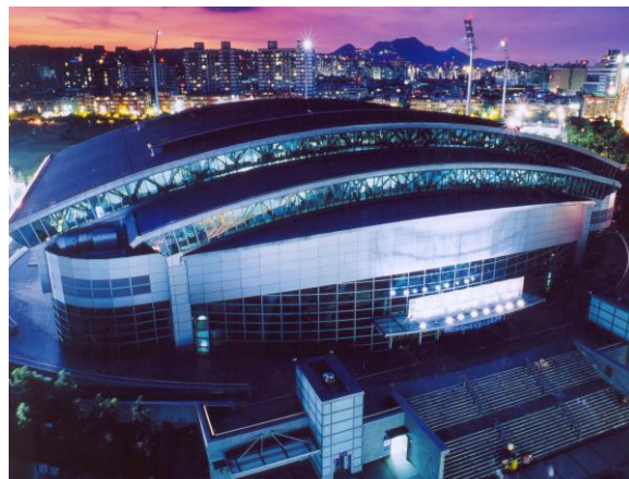
Venue: Hsinchuang Gymnasium